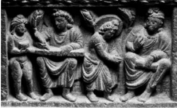
Figure 1.1 Siddhārtha Learns Writing

the drawing up of more complex lists. Although writing has certainly exerted an important influence on Abhidharma literature, 34 the initial stages of development with which I am concerned here still take place within a predominantly oral culture. 35