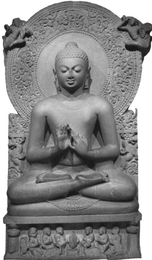
Figure 3.2 Turning the Wheel of Dharma

The relief shows the seated Buddha with his hands in the gesture of setting in motion the wheel of Dharma. Below the Buddha in the centre is the wheel of Dharma, with an antelope on each side, reflecting the location of the first sermon at the Mṛgadāva. The wheel is surrounded by the first five disciples, who listen with respectfully raised hands.