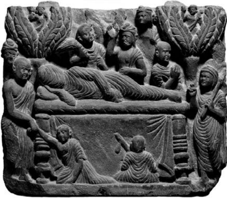
Figure 1.3 The Buddha's Passing Away

The relief vividly expresses the sense of loss that the Buddha's demise must have evoked among many of his disciples. The Buddha is shown with his face covered by his robes, conveying the fact that from now on his disciples will no longer be able to see him or be seen by him. Directly below the covered face his close attendant Ānanda is depicted overwhelmed by grief. The scene thus provides a telling contrast to the relief on the cover of the present book, which shows the Buddha alive and delivering a teaching, surrounded by listeners with devout attention.