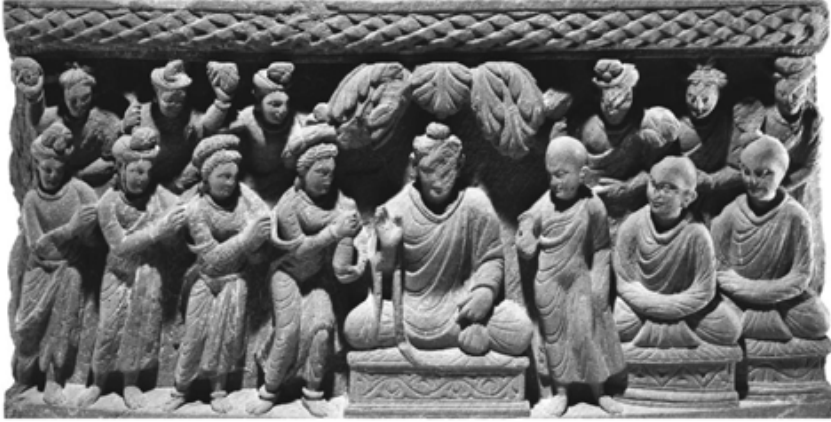
Figure 2.2 Mahāprajāpatī Requests Ordination

Only the Saṃmitīya Vinaya takes up a related case, prohibiting a nun from asking a monk difficult questions. 73 Thus the Abhidharma is not mentioned in any of the Vinaya versions of this particular principle to be respected.