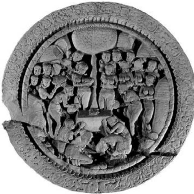
Figure 4.1 Sujātā's Offering

The medallion shows Sujātā offering food to the bodhisattva Gautama, represented by his seat under the tree of awakening.