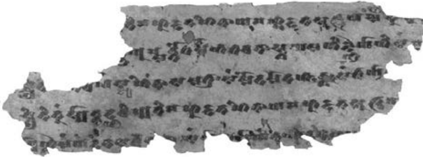
Figure 1.2 Saṅgīti-sūtra Fragment

Similar statements can be found in the Theravāda Dīgha-nikāya and Dharmaguptaka Dīrgha-āgama versions of the Saṅgīti-sūtra . 55 The formulation highlights a predicament that must have been acutely felt in an oral setting once a teacher had passed away: how to determine what he taught, if there are no written records? The need to arrive at an oral consensus on what the teacher had taught is precisely what informs the purpose of the Saṅgīti-sūtra .