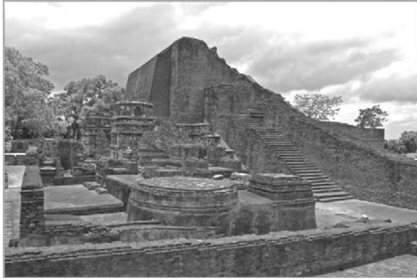
Figure 3.1 The Stūpa of Śāriputta

The report in the Anupada-sutta that Śāriputta determined the mental states of each absorption one by one endows the Abhidharma approach to analysis with the prestigious authority of having been the actual form of meditation practice undertaken by the disciple whom the early tradition reckoned as outstanding for his wisdom. 44