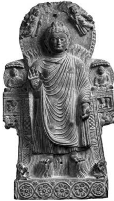
Figure 2.1 The Twin Miracle

The stela shows the Buddha performing the twin miracle, which requires the simultaneous manifestation of fire and water emerging from different parts of one's own body, 11 an expression of complete mastery over these material elements.