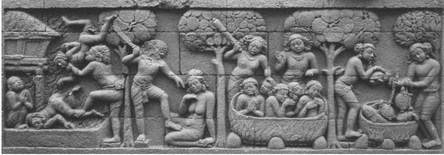
Figure 2.3 Punishment in Hell

reliefs well beyond the Indian subcontinent, namely the panels of the Borobudur stūpa in Java. 109