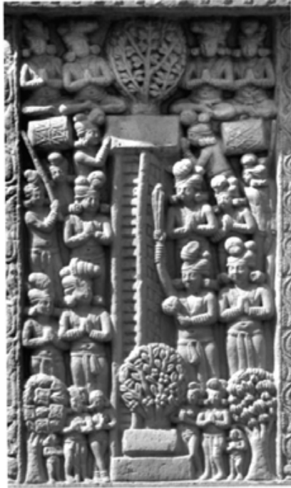
Figure 4.2 The Buddha's Descent from Heaven

visiting India in fact describe the remains of the stairs that were believed to have been used by the Buddha on this occasion. 96