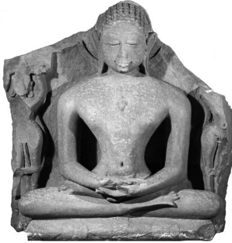
Figure 3.3. Jain Tīrthāṅkara

Indian setting, a claim to omniscient knowledge was made by the leader of the Jains. 90 The Buddhist texts reflect awareness of such a claim. 91